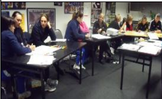
Apprentice Coaches, (above) hard at work during this year's NPC at Auckland/Waitakere.